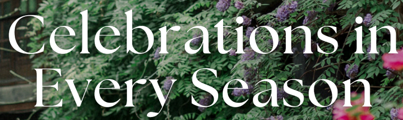
ASHTON CREEK VINEYARD