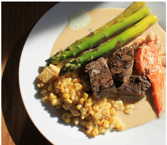
Top Right Photo by Lexie Hand Photography