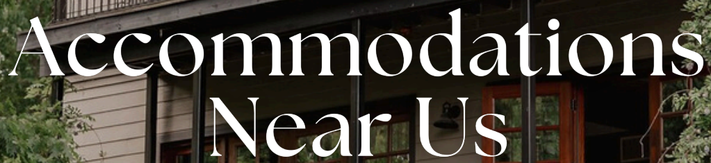
ASHTON CREEK VINEYARD