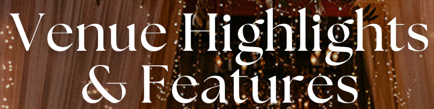
ASHTON CREEK VINEYARD